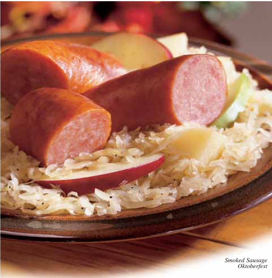
Smoked Sausage Oktoberfest

When you take advantage of a variety of easy-to-prepare or fully cooked ingredients, you can easily treat your family to a hot, hearty and welcoming Old World meal in a fraction of the time it used to take. No need to buy a long list of special ingredients or to stand over a hot stove for hours like Grandma did, because today's meal solutions can be put together for a memorable family dinner in minutes. Even a busy family will want to enjoy and savor the hearty flavor of these smoked sausage dishes.