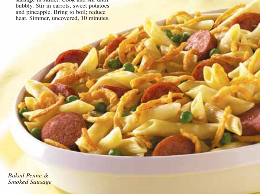
Baked Penne & Smoked Sausage

Heat oven to 375°F. Cut sausage into 1/4-inch slices and brown in skillet; drain. Combine soup and milk in 3-quart casserole. Stir in pasta, sausage, 1/2 cup cheese, 1/2 cup French-fried onions and peas. Bake 45 minutes covered tightly with foil. After 45 minutes, uncover and top with remaining cheese and onions. Bake 3 minutes until golden. Let stand 5 minutes before serving.